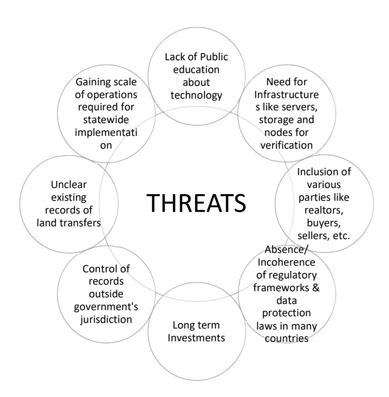
Figure 4- Pictorial Representation of Threats of Blockchain Implementation