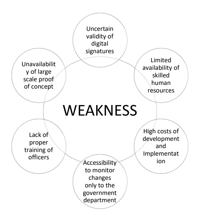
Figure 2- Pictorial Representation of Weaknesses of Blockchain Implementation

• Unavailability of large-scale proof of concept- The proof of concept available from implementation of blockchain is still limited to smaller regions. Large scale proof of concept of application in blockchain technology is still not available.